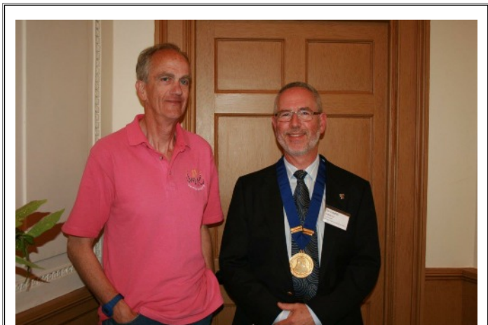
The new President and Vice-President at Edinburgh