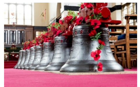
The new jigsaw