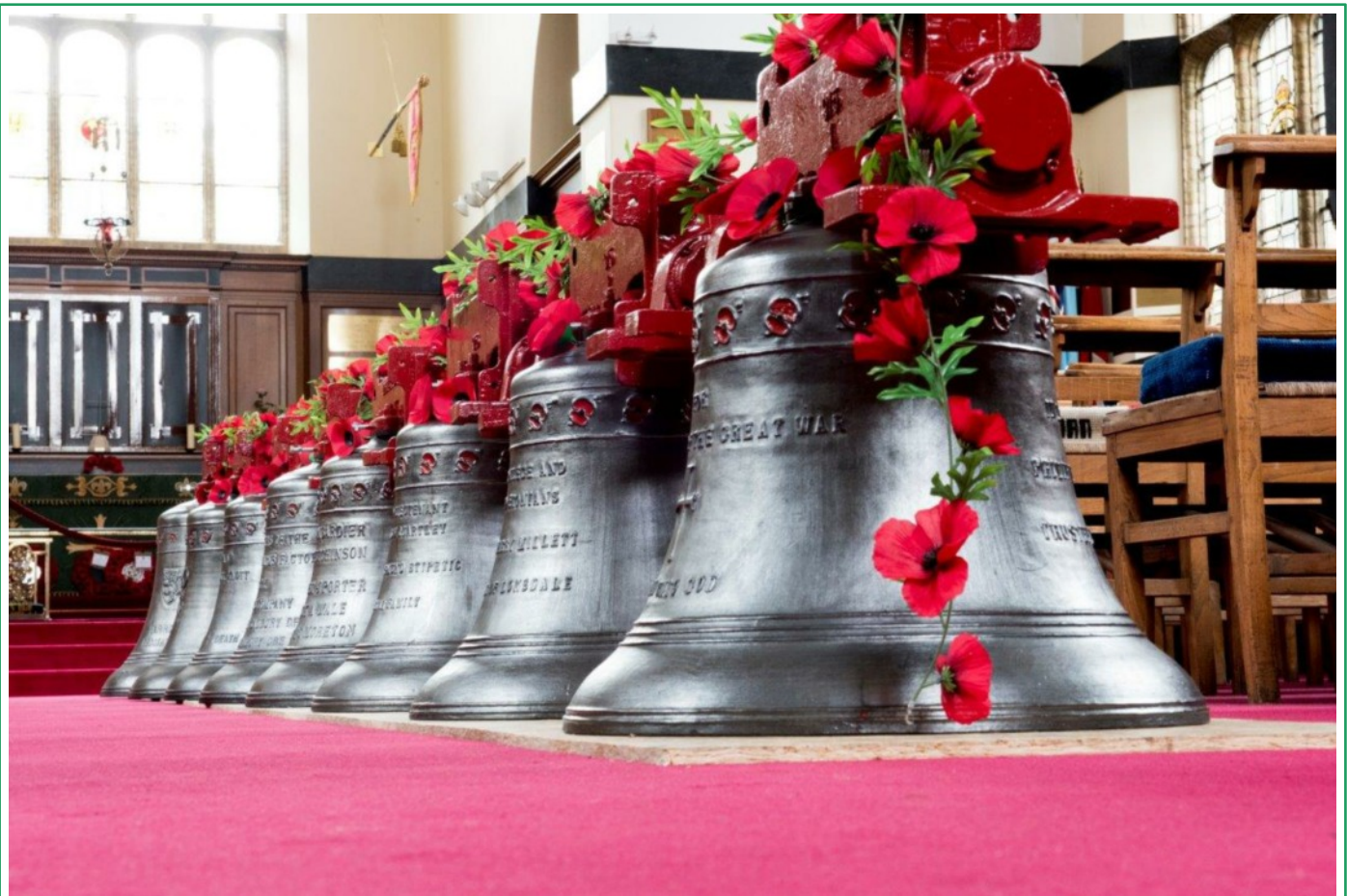
Bells for St George's, Ypres, the new Bell Restoration Committee jigsaw